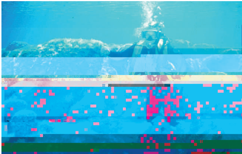
FIG. 4. A diver's depth profile over time. The vertical axis represents depth in meters, and the horizontal axis represents time. The color scale indicates depth, with blue representing shallow water and red/purple representing deeper water. The diver's depth fluctuates between approximately 10 and 20 meters.