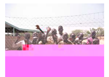
Refugee Children at the Sudanese Border, Kenya