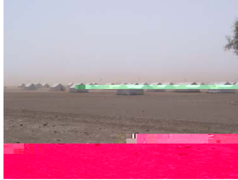
Kakuma Refugee Camp, Kenya