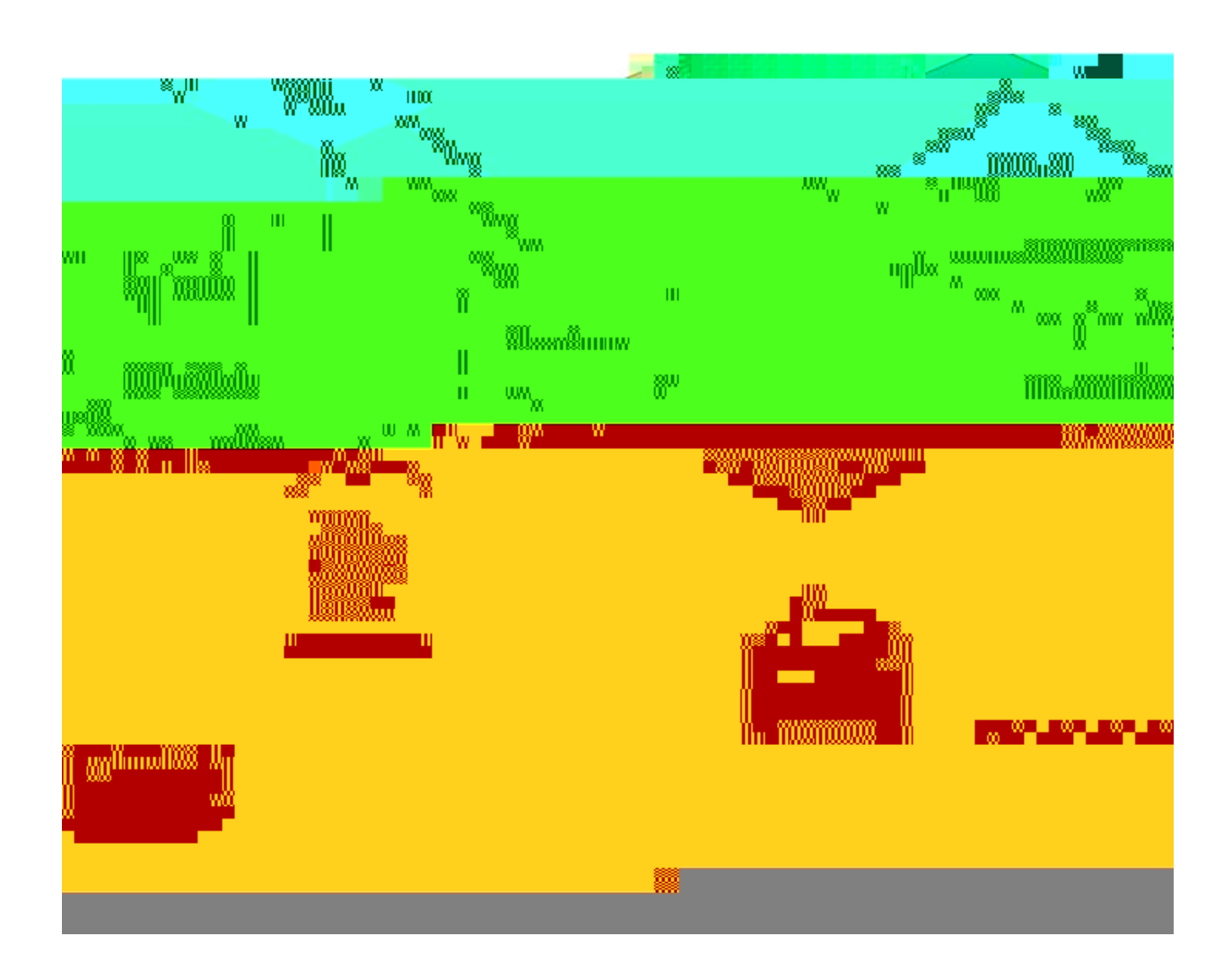
Figure 1: Possible future PIT lodgment system

payments during the year, supported by robust withholding schedules and the ability to claim deductions. Indeed, though not necessarily economically rational, it is the annual expectation of refunded overpaid tax that may seem to be more critical. If the New Zealand experience has taught us anything, it is the realisation that the promise of a refund would seem to be one way of keeping people engaged in the system. Therefore a possible model for Australia, could a hybrid of both the reduced filing and pre-filling systems (as is being canvassed in the UK) where the majority of people do not lodge returns, and those with more complex tax affairs may have access to pre-filled information via an online account (similar to the ATO's current tax agent portal). Such a scenario is depicted in Figure 1.