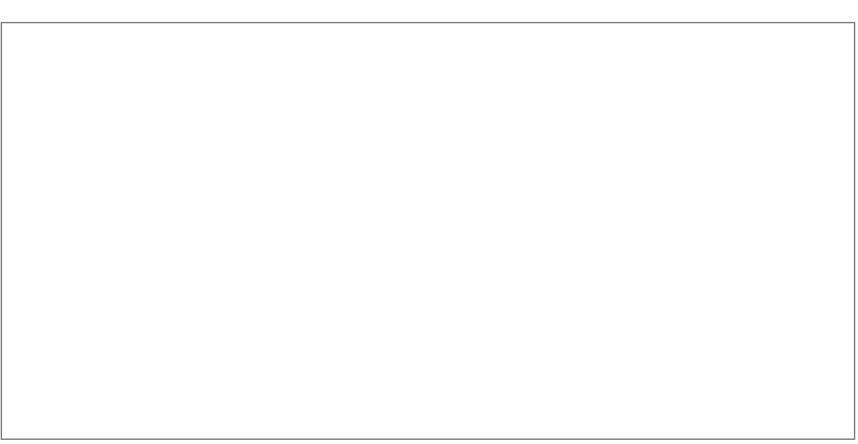
Figure 2 - The path estth ri the Crt hce4( ) B[(Te-2(ha7 0v)t)